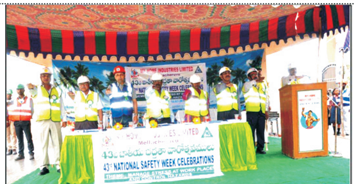
విభాగాల అధికారులు, కార్మికులు, ఉద్యోగులు కుటుంబ సభ్యులు పెద్ద సంఖ్యలో పాల్గొన్నారు.